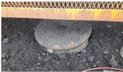
Take up trolley track wheel

“I am happy that we can reduce the time taken to tension and de-tension the conveyor belt by automating the winches. This will drastically improve the MTTR.”