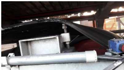
Conveyor belt out of alignment

Coal mining operations mine and deliver coal from open cast pit to a crushing circuit. The crushing circuit reduces the overall coal size of the ROM coal so that it can be handled and processed with ease. This coal is conveyed from the ROM silo to the coal preparation plant to wash, separate and stockpile the coal in grades to transport it to the market. Conveyor 202 conveys coal from the crushing circuit to the silos, the take up trolley designed to tension the belt experienced a failure where the take up track wheel came off and resulted in a stoppage of ROM feed to the silos.